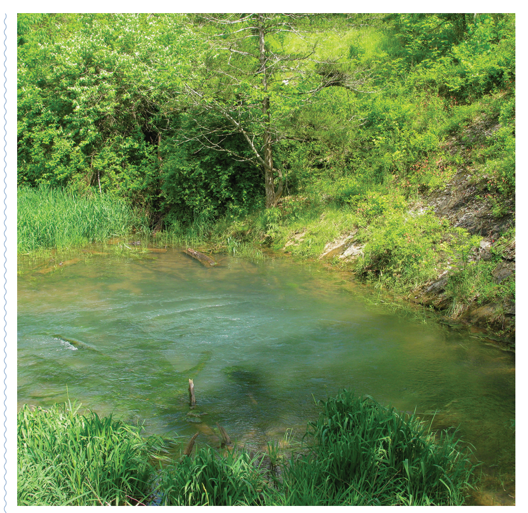
Sander Spring, located near the Watershed Center at Valley Water Mill Park, visibly "boils" after a recent storm.

This factsheet is not intended to diminish our sense of wonder about springs. Instead, it is meant to increase our appreciation and understanding of them—to illustrate their values and explain why we need to protect them. Springs can tell us a lot about the health of our environment. They serve as sensitive indicators, telling us when our activities on the surface of the land pollute the groundwater below. Springs replenish and sustain Ozark streams and lakes during times that, without springs, such bodies of water would be bone dry. And springs are ultimately connected to the deeper groundwater system or aquifer, the one that thousands of Ozark residents depend on for their drinking water supplies.